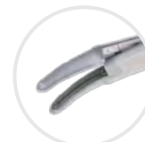
Maryland Fusion Device